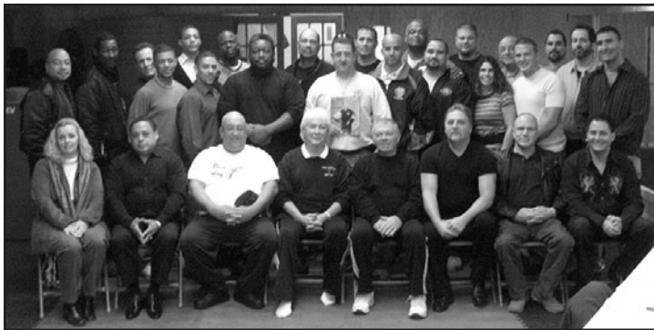
Just for Champions School Owners Breakfast